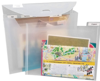
Fab File A4/8.5x11