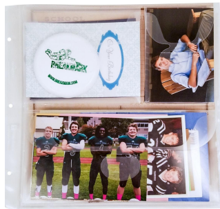
Expanding Project Planners