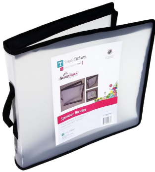
12x12 Craft Binder